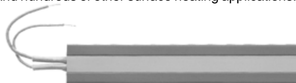
Type L2 - Widths over 1"