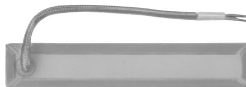
Mica Strip Heaters are also available with lead modifications as shown in the Mica Heater Band section